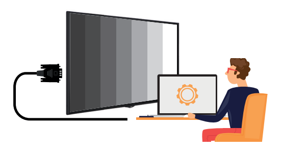
Display Control over RS232 and LAN

Using either Microsoft Wireless Display Adaptor or Android Screen Sharing functions on Windows and Android devices, you can mirror screen to the display using embedded wireless display capabilities without using any external devices or cables.