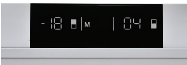
LED Touch HP Display

Cabinet door is mounted directly onto the refrigerator door and with the help of the hinge, the refrigerator opens wider and closes Automatically.