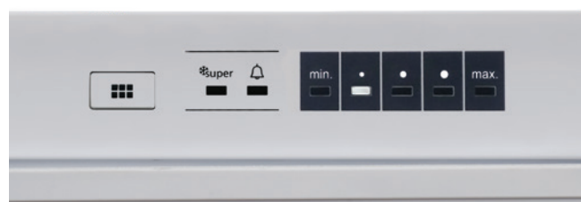
Push Button HP Display

Cabinet door is Connected to the refrigerator door with sliding rails.